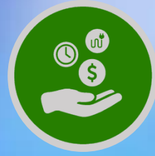
Value & Affordability