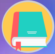
Quality of Content