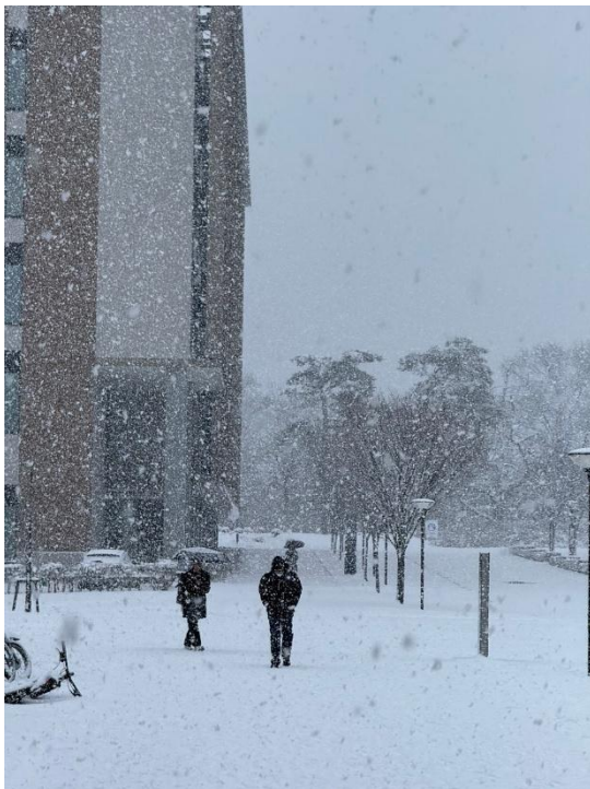
Big Snow on Aobayama Campus

After completing the Double Degree program, I made the decision to enter the workforce rather than pursue a PhD. While I found research fascinating, I ultimately chose to apply my skills in a professional environment. I have since secured a job and am excited to embark on this new chapter of my career. The knowledge and experience I gained at Tohoku University have undoubtedly prepared me well for this next step, and I look forward to the opportunities ahead.