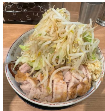
Menya Pig Mountain