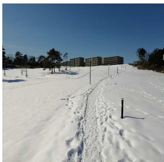
Aobayama University House