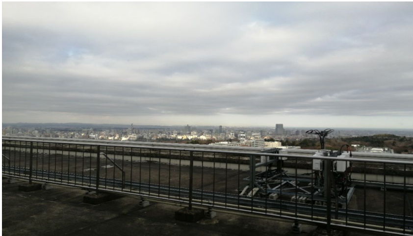
Sendai city seen from Aobayama

Personally, including the dormitory cost, and excluding what I could spend for trips or restaurants, I can live with 650 euros per month (300 to 350 euros for dormitory including electricity, water, ...), but it really depends on how you spend money. If you travel or go out a lot, it can be much higher than that.