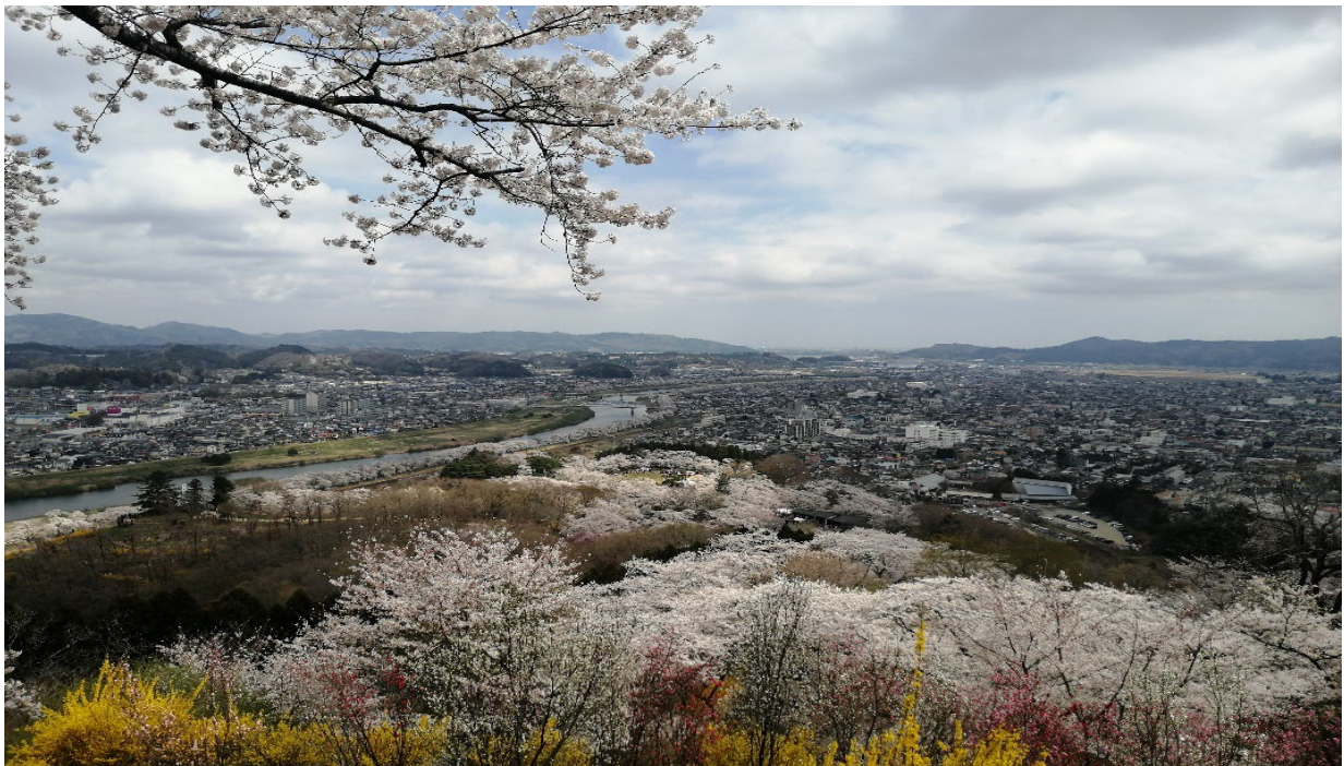
Ogawara Funaoka Castle Ruins Park

It is possible to work in Japan after the master's degree. However, from what I heard, the starting salary in Japan is quite low compared to France or other countries. It seems that experience and age is much more important in Japan, and they do not place much importance on your diploma (only based on what I heard and might depend on the field). Your status and salary start low and only go up with age, which contrasts with France and other countries. But there might be some international companies in Japan that do not necessary proceed in this way (I am not well informed on this matter though).