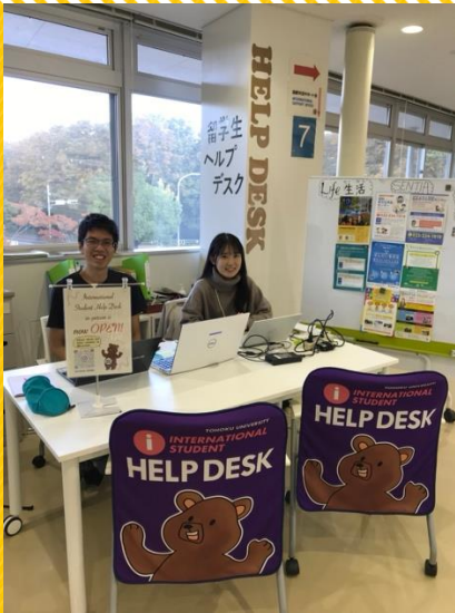
International Student Help Desk

We want you to join our team!! 東北大学の国際化に貢献しませんか？