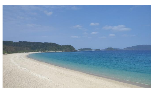
Beach in Okinawa