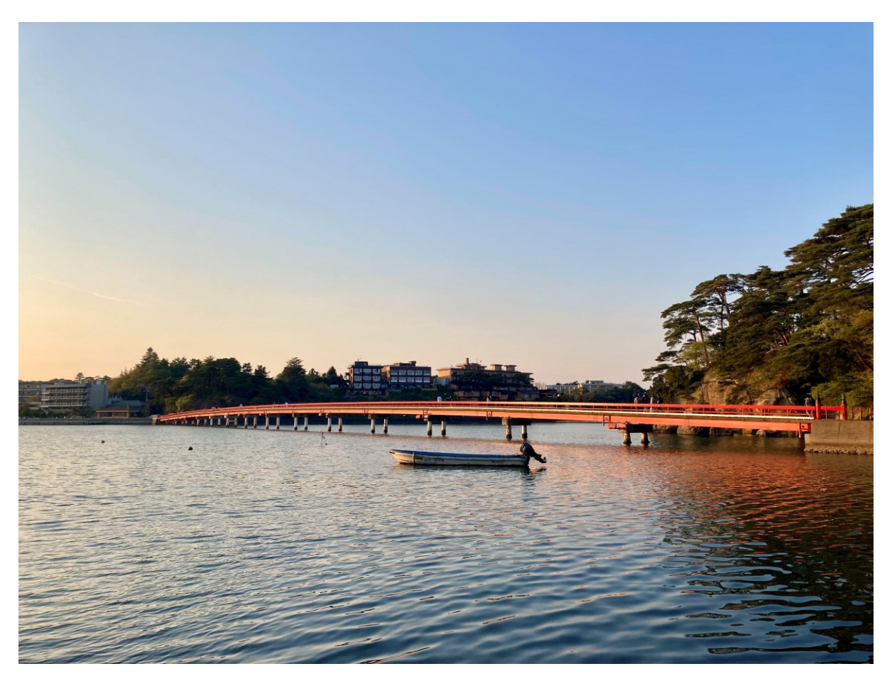
Figure 1 - The beautiful bay of Mastushima.