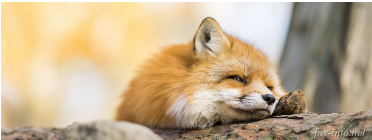
Fox village (きつね村)

Around Sendai: Fox village, Matsushima, Zao Onsen (skiing in winter)