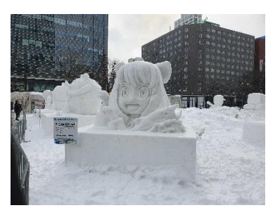
Yuki Matsuri, Sapporo