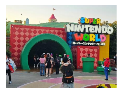
Nintendo world, USJ, Osaka