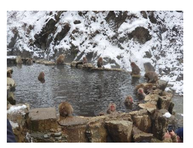
Snow Monkey Park, Nagano