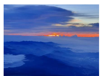
View from the top of Fuji-san