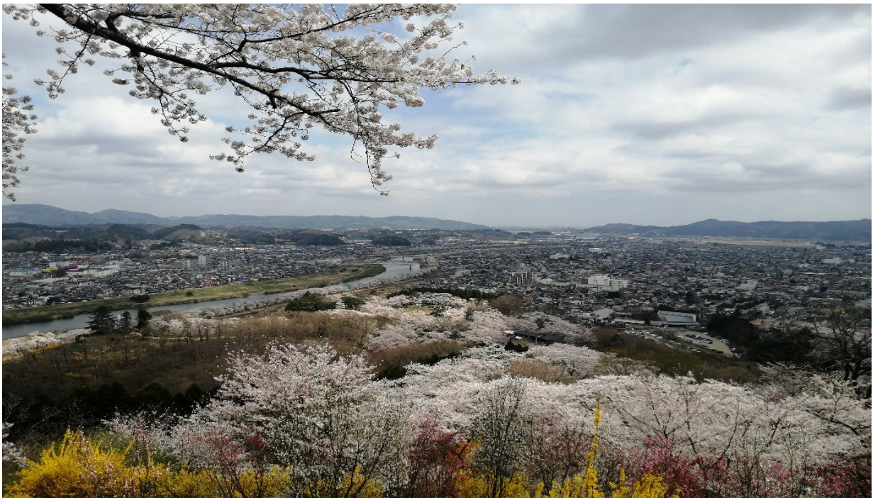
Ogawara Funaoka Castle Ruins Park

It is possible to work in Japan after the master's degree. However, from what I heard, the starting salary in Japan is quite low compared to France or other countries. It seems that experience and age is much more important in Japan, and they do not place much importance on your diploma (only based on what I heard and might depend on the field). Your status and salary start low and only go up with age, which contrasts with France and other countries. But there might be some international companies in Japan that do not necessary proceed in this way (I am not well informed on this matter though).