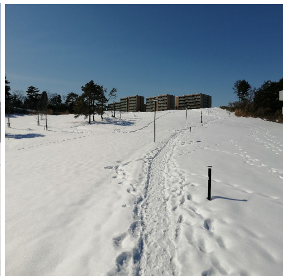
Aobayama University House