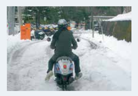
Rain/Snow/Ice Drive slowly Be careful of skidding/falling

When road conditions are poor due to rain, snow, or ice, accidents are more likely to occur on hills, and even flat stretches of road. Please observe traffic laws to lessen the likelihood of accidents, and always drive carefully.