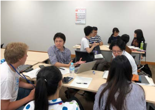
Project Work with TU students

Applicants are required to fill in the online application form and upload the required documents no later than the deadline below. Note that the results of an online Japanese test are used to balance the number of students in the appropriate classes.