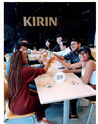
Company visit : KIRIN Brewery