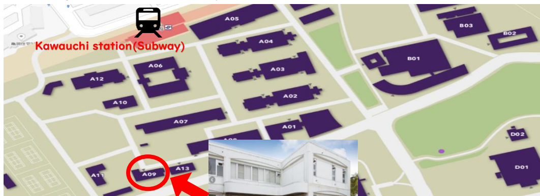
Student Health Care Center(A09)

※ There are no parking spaces, so please come by public transportation etc.