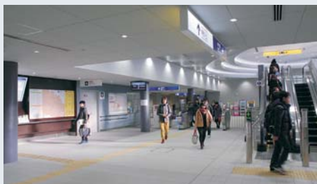
Kawauchi Station (interior)