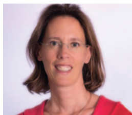
C. Kwapil (© OeNB)