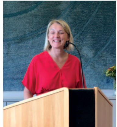
Evelyn Regner ( Vice-President of the European Parliament )