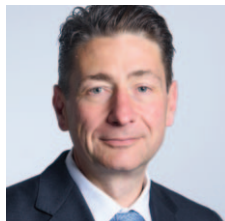
N. Forgó

Requirements: Regular attendance and active participation in class discussions (40%) and an open-book essay exam (60%).